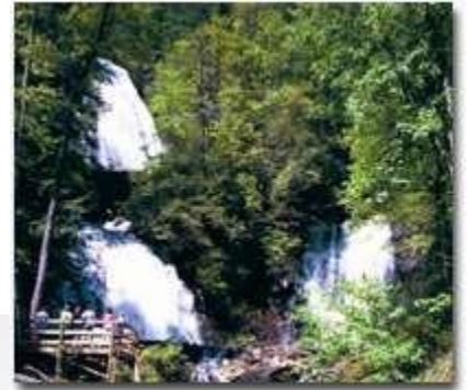
Anna Ruby Falls Georgia's most popular falls

A rare double waterfall, most popular in the state, Anna Ruby Falls , is just north of the Bavarian village. Other falls in the area include Horse Trough Falls , in the Mark Trail Wilderness. The bridge at the beginning of the short trek to the falls is notable. It is the first bridge across Georgia's Chattahoochee River.